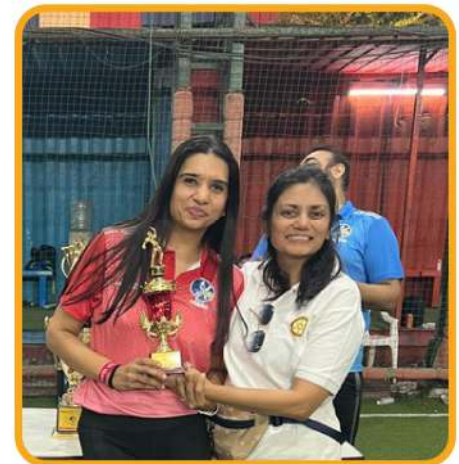
Best Bowler Female