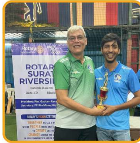
Best Bowler Male