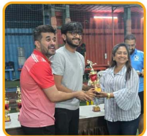
Best Fielder Male