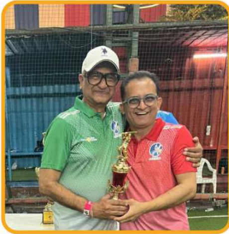
Man of the Series