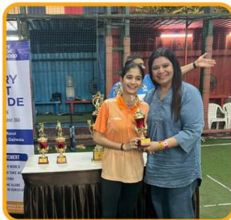
Best Fielder & Batter Female