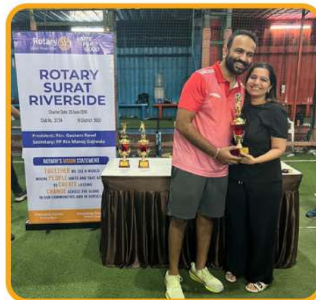
Best Batter Male